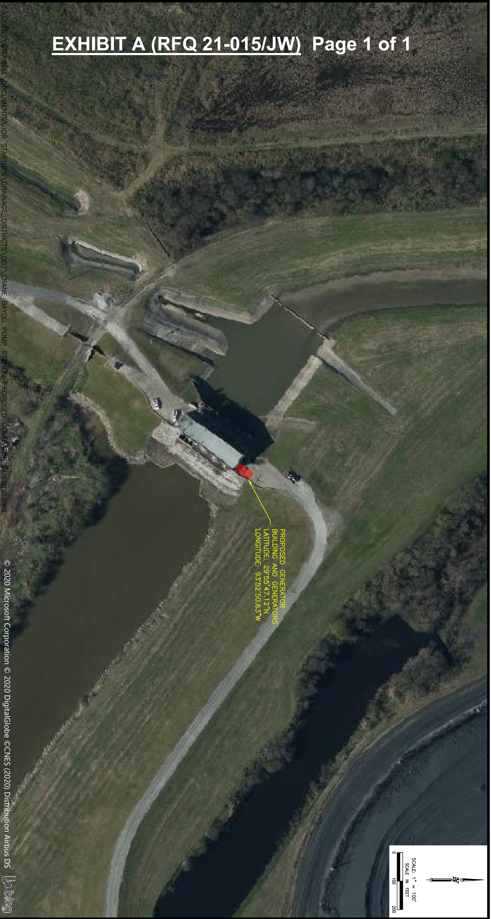
EXHIBIT A (RFQ 21-015/JW) Page 1 of 1